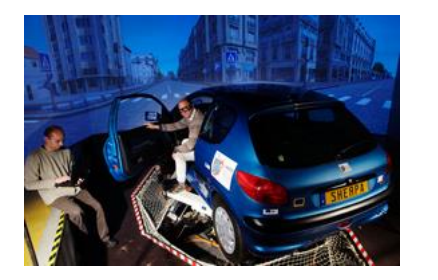
SHERPA Hybrid Simulator for Automotive Studies

Real-time experiments can be conducted at LAMIH with the testbenches facilities (figure 2). Moreover, the facilities include a smooth integration; from trials in simulators (that can use extra information to validate the approaches), to real-time tests including experiments on tracks, with the necessary back and forth between methodology, simulation, simulators and real-time.