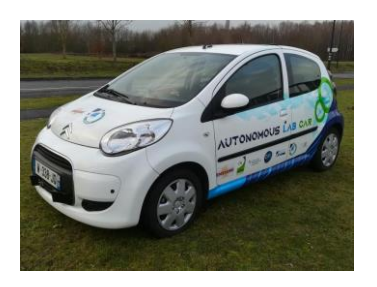
Equipped Autonomous Vehicle at LAMIH